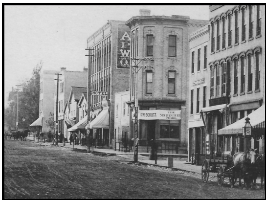
The 100 & 200 blocks of W. Main Street, circa 1886

In 1841, pioneer brothers John and Luther Cole opened the first dry goods store in Watertown at the corner of Main and Second streets. By 1845, a dozen more businesses opened their doors on Main Street. As rapid growth in Watertown continued, the early wood frame buildings of the pioneer era were replaced by more substantial brick buildings and by 1885, the majority of the classic buildings standing today in downtown Watertown had already been constructed.