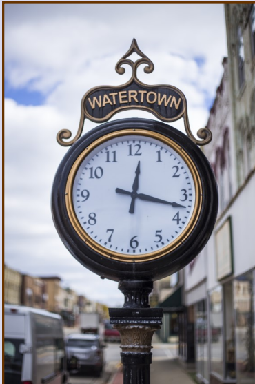
Watertown Street Clock located at 111 E. Main St.

Browse our unique shops, sample delicious fare at a variety of local restaurants and take in the scenic beauty of the Rock River that led to the establishment of this vibrant and picturesque city.