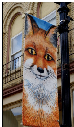
Art on Main banner

The Main Street Program strives to increase economic vitality by ensuring the lines of communication are open between the downtown community and City Hall. The program also hosts an annual open forum, Main Street Matters , where citizens share ideas aimed at improving our downtown.