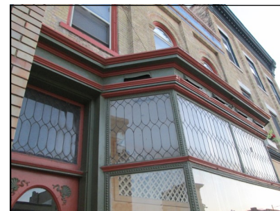
Historic, well-preserved buildings with original features line Main Street in downtown Watertown. 309 E. Main St.